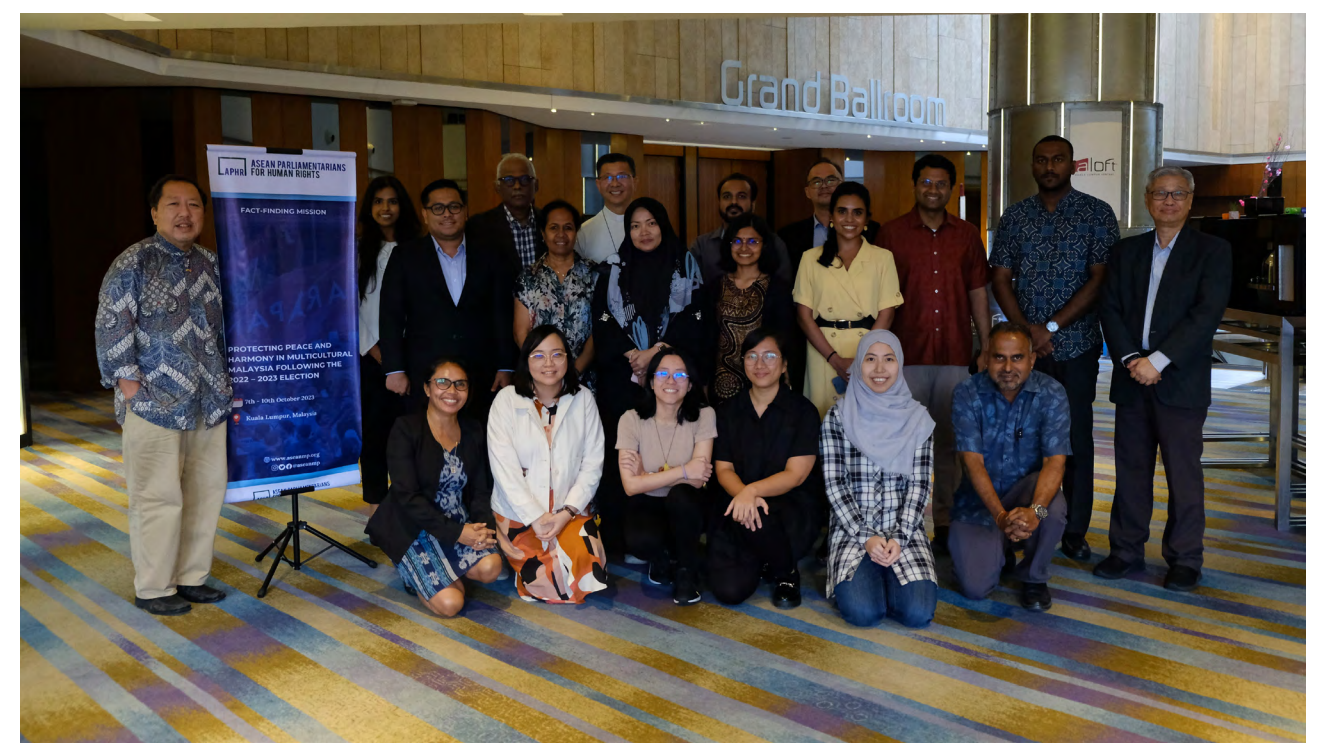
The Mission holds a roundtable discussion with interfaith leaders in Kuala Lumpur, Malaysia

UMNO's stronghold consisted of Malay voters from the rural areas and of lower socioeconomic status, via a combination of ethno-nationalist appeal and control of patronage resources. UMNO's image as the protector of Malay rights shattered with the 1MDB corruption scandal and the Malay constituents' confidence in the party waned upon the party's fall in the 14th General Election. For Malay voters, the Perikatan Nasional coalition (PN) (of which PAS is a part of) thus constituted the next best alternative. Another secondary factor that further fuelled conservatism, cited by CSOs, faith leaders, and parliamentarians, was political instability, i.e., namely having four Prime Ministers in four years and having the first-ever hung Parliament after GE15.