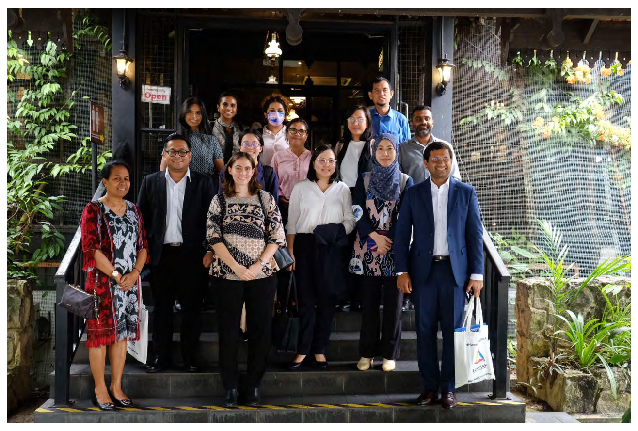
After discussions with Commissioner Zoe Randhawa of Malaysia's Election Commission (Suruhanjaya Pilihan Raya - SPR)

hrough the delegation's enquiry on the role of selected key institutions in addressing hate speech, it is found that there are systemic gaps that impede effective intervention in this issue.