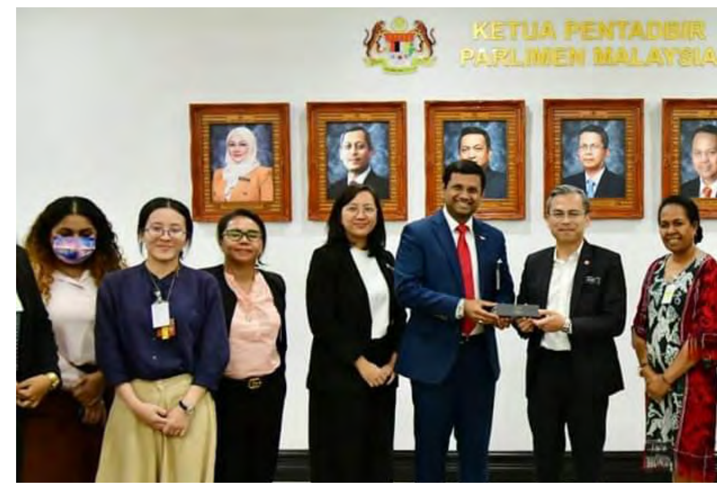
APHR Fact-Finding delegation with Hon. Fahmi Fadzil, Malaysia's Minister of Communication and Digital and also APHR member

alaysia is a diverse and vibrant country in Southeast Asia that is home to a number of races, religions, and ethnic groups. It has a current population of 32.7 million and according to the latest census conducted in 2020, Muslims constituted the largest proportion of Malaysia's religious demography (63.5%), followed by Buddhists (18.7%), Christians (9.1%), Hindus (6.1%), and others (2.7%). Almost all Muslims practise Sunni Islam of the Shafi'i school.