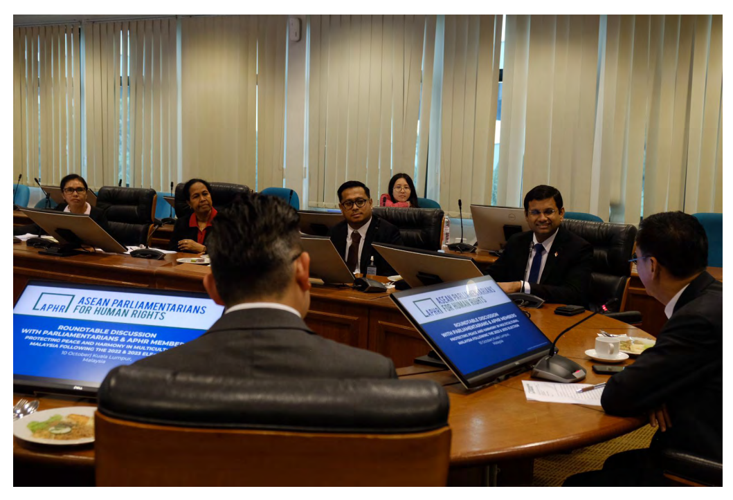
The Mission delegation during a roundtable discussion with parliamentarians in Malaysia's House of Representatives (Dewan Rakyat)