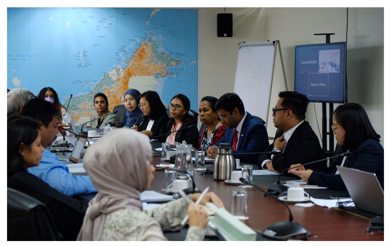
The delegation meets with the National Human Rights Commission of Malaysia (Suruhanjaya Hak Asasi Manusia Malaysia - SUHAKAM)

fell short of addressing religious harmony and interfaith understanding within its framework, despite commendable in its emphasis on the Federal Constitution and Rukun Negara and recognition of a shared history.