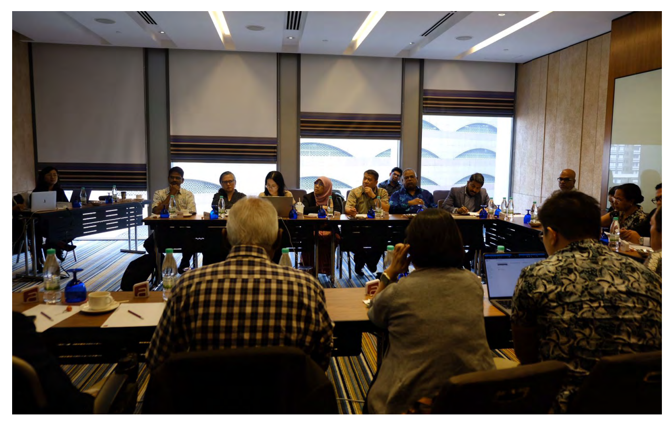
Consultation meetings and discussions with Civil Society organizations in Malaysia

nature of state ceremony and does not support the notion of an Islamic state; equally important, secularism does not connote an anti-religious or anti-Islamic state of governance. CSOs and faith leaders cited the controversy on the use of 'Allah' as an example of a FoRB violation that emerged as a result of the corrosion of secularism. In 2008, the government banned a Catholic online newspaper, The Herald, for using the word 'Allah' in its publications. By 2014, the Federal Court had rejected the Catholic Church's appeal of the Home Ministry's ban, hence upholding the Court of Appeal's decision that ruled in favour of the government's position. This Federal Court decision marked the turning point for the government to reaffirm its commitment to the 2011 ten-point Cabinet solution banning Christians in Peninsula Malaysia from using the 'Allah' word.