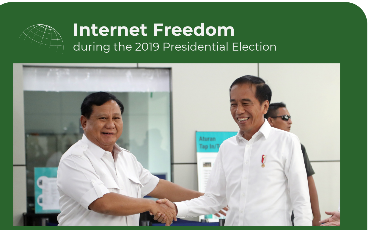
Joko Widodo and Prabowo Subianto in 2019 General Elections.

It is important for Indonesia to ensure that the policy framework and their implementation protects fundamental freedoms and promotes healthy discourse and democratic activities online in the upcoming election period.