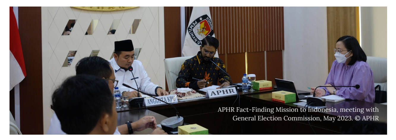
Fact-Finding Mission: Assessing Fundamental Freedoms Online during the 2024 General Elections