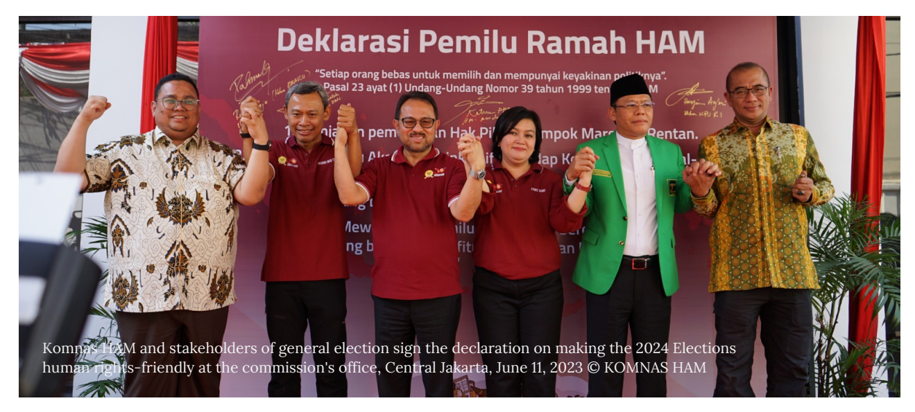
Fact-Finding Mission: Assessing Fundamental Freedoms Online during the 2024 General Elections

In line with their mandate to protect fundamental freedoms offline and online, the Komnas HAM engages in public awareness campaigns and provides guidelines to election participants on respecting diversity, particularly crucial during campaigns. The guidelines include the Norms and Regulatory Standards (Standar Norma dan Prosedur, SNP) No. 5 on Freedom of Expression and Opinion.<sup>59</sup>