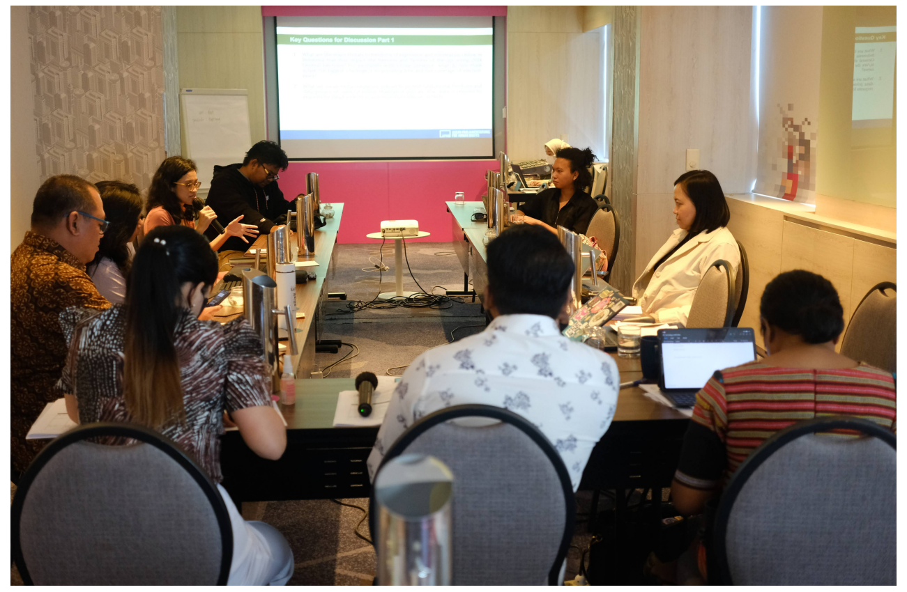
APHR Fact-Finding Mission to Indonesia, meeting with CSOs in Jakarta, 2023

It is therefore imperative for the government and election management bodies to review policies found to have provisions that restrict fundamental freedoms and develop protection mechanisms to allow for these freedoms to thrive online, providing the space for balanced, informative, and constructive discussions about the electoral process