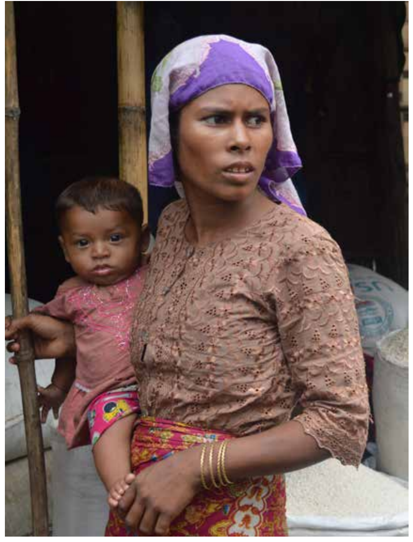
A Rohingya woman and her child stand outside a food distribution center in the Sittwe IDP camps. Rohingya IDPs are concerned about starvation as they struggle with little to no access to government services.

Statements like these from government officials reinforce existing perceptions among Rohingva that there is no hope for their future in Myanmar. Rohingya told APHR that they have little trust in the government, citing lack of access to citizenship, ongoing rights abuses perpetrated by government forces, and the absence of the rule of law. In practice, they are also excluded from government service. There are few, if any, Rohingya working in local government in northern Rakhine State, even though Rohingya make up between 90 and 95 percent of the population there.<sup>19</sup>