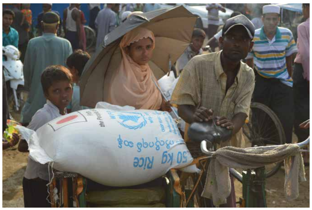
A displaced Rohingya family in Sittwe collects their WFP rations for the month. Stripped of their rights and without access to work, many Rohingya are dependent on international aid for survival.

Earlier this year APHR assessed the ongoing state-sponsored abuses and systematic discrimination against Rohingya and concluded that they indicate a high risk of genocide, war crimes, and crimes against humanity.<sup>5</sup> The situation in Rakhine State has only deteriorated since. Disenfranchisement, combined with economic depression, lack of access to livelihoods, and dire humanitarian conditions, will drive increasing numbers of Rohingya to flee the country.