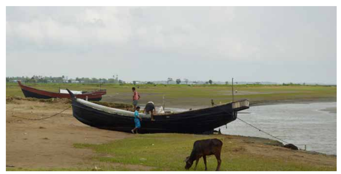
Boats docked near Aung Daw Gyi IDP camp in Sittwe. In recent years, Rohingya have increasingly taken to fleeing Rakhine State by sea, often falling into the hands of human traffickers.

In recent years, Rohingya have increasingly taken to fleeing Rakhine State by sea, in hopes of seeking refuge in Malaysia, Indonesia, and other ASEAN states. In 2009, the Thai Navy found several fishing boats filled with starving Rohingya off the coast of Thailand. These individuals were towed back out to sea and later arrived on the Indian-held Andaman Islands.<sup>34</sup> The Arakan Project estimated that a total of 6,000 Rohingya fled Rakhine State on boats in 2008.<sup>35</sup>