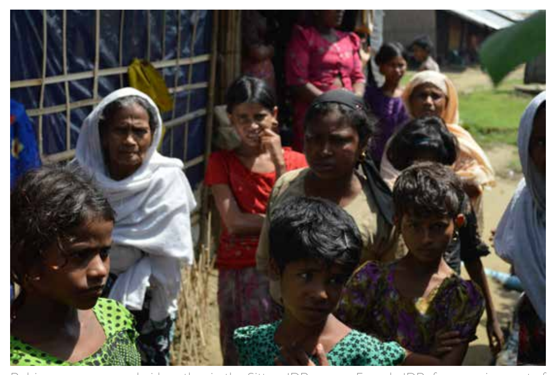
Rohingya women and girls gather in the Sittwe IDP camps. Female IDPs face a unique set of hardships, and in many cases must work to support their children single-handedly.