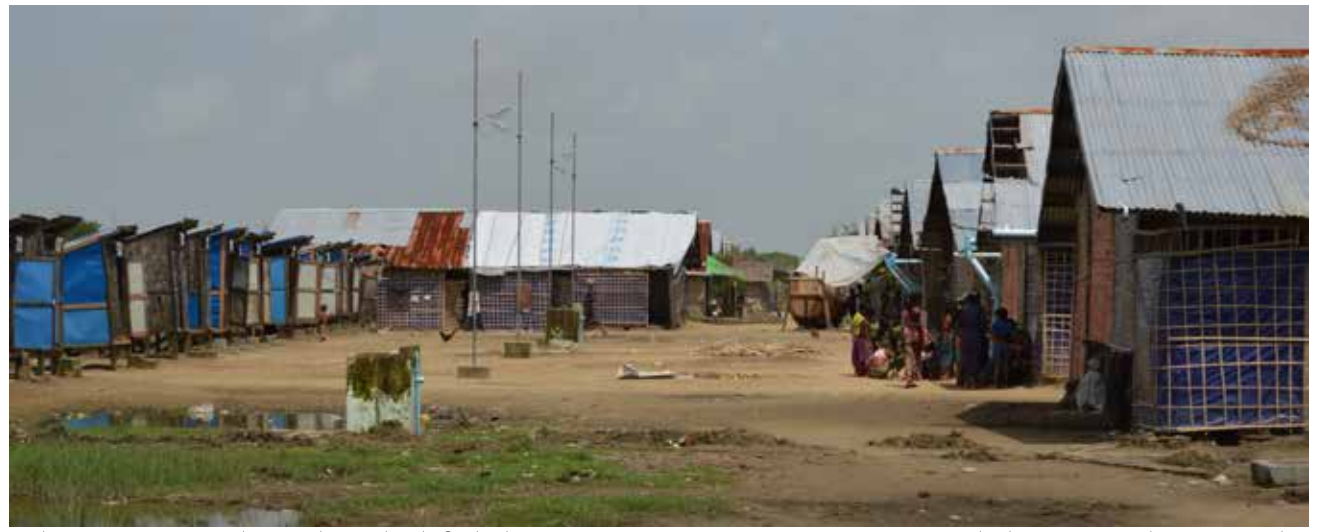
Rohingya IDPs stand outside makeshift shelters in Dapaing IDP camp, Sittwe. Many shelters are inadequate in the camps, one of a number of hardships faced by displaced Rohingya.

Rohingya IDPs are concerned about starvation. Community leaders in Say Tha Mar Gyi IDP Camp told APHR that only about half of the IDPs there are registered with the World Food Programme and eligible to receive food aid. In all of the camps APHR visited, the rations for August 2015 did not arrive until the end of the month, and families had to cope for several weeks of severe shortages. IDP families complained that rations were insufficient and that they had to find other food with which to supplement them. Because very few people have a source of income, families must sell some of their rice ration to pay for other types of food and necessary items like firewood for cooking. The family-level monetization of food aid further decreases the amount of nutrition available.