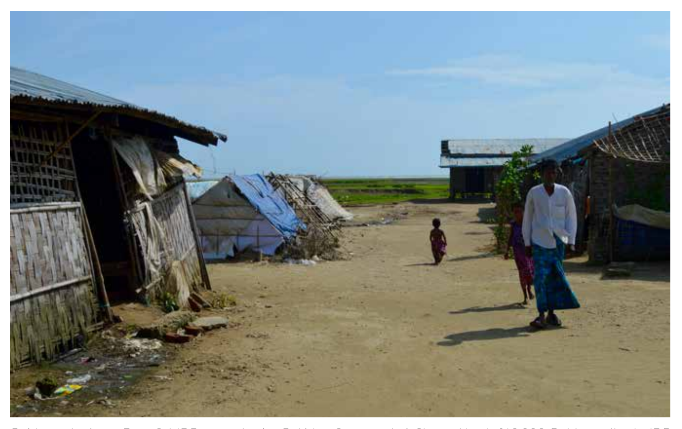
Rohingya in Aung Daw Gyi IDP camp in the Rakhine State capital, Sittwe. Nearly 140,000 Rohingya live in IDP camps throughout the state, many with extremely limited access to essential services.

Other international actors, including the UN, the EU, and the United States, have a role to play as well. In addition to pressuring the Myanmar government to end its policies of oppression, they must work to convince ASEAN member states to more robustly address the drivers themselves.